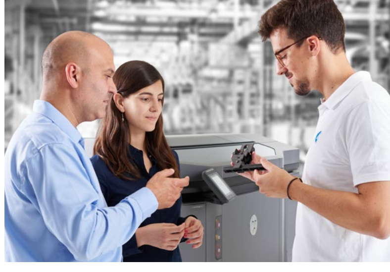
Learn more at hp.com/go/3DSupport